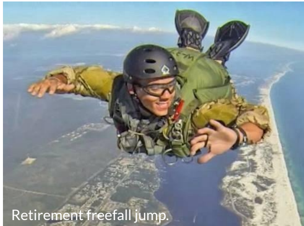
Retirement freefall jump.

Helping A Hero is a 501 (c) (3) organization that provides specially adapted homes for severely wounded Global War on Terror veterans.