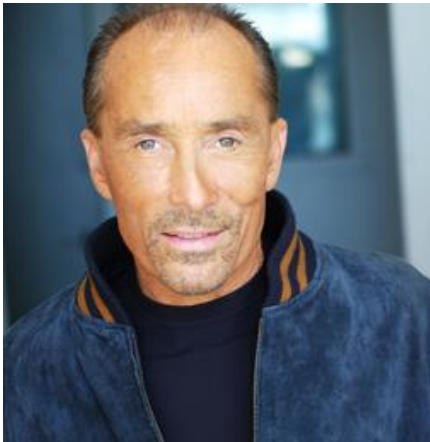
Special Performance by Lee Greenwood "God Bless the USA"